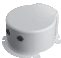
FD CSE 56T VA